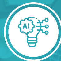
Enterprise AI Solutions